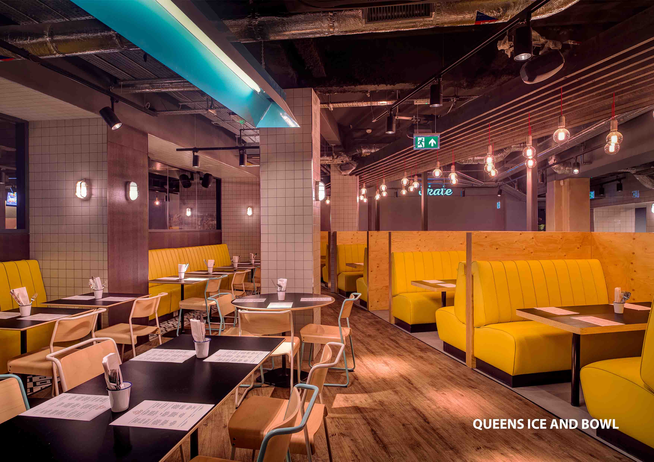
QUEENS ICE AND BOWL